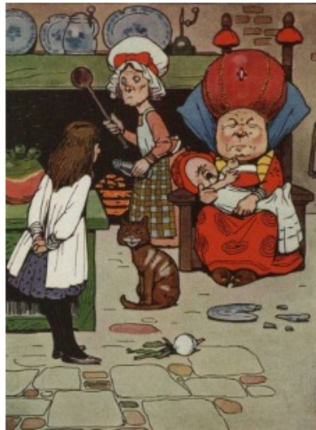
Alice in the Room of the Duchess.

Copyright, 1916, by SAM'L GABRIEL SONS & COMPANY NEW YORK